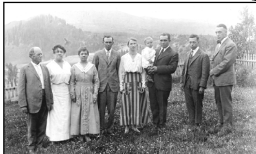
Gooding Family Exhibit → opened in October 2011