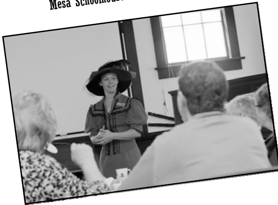
Mesa Schoolhouse Program - Sept. 2011