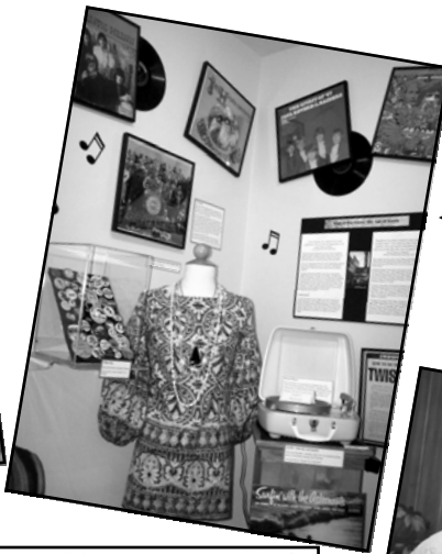
← 1960s Exhibit opened in June 2011